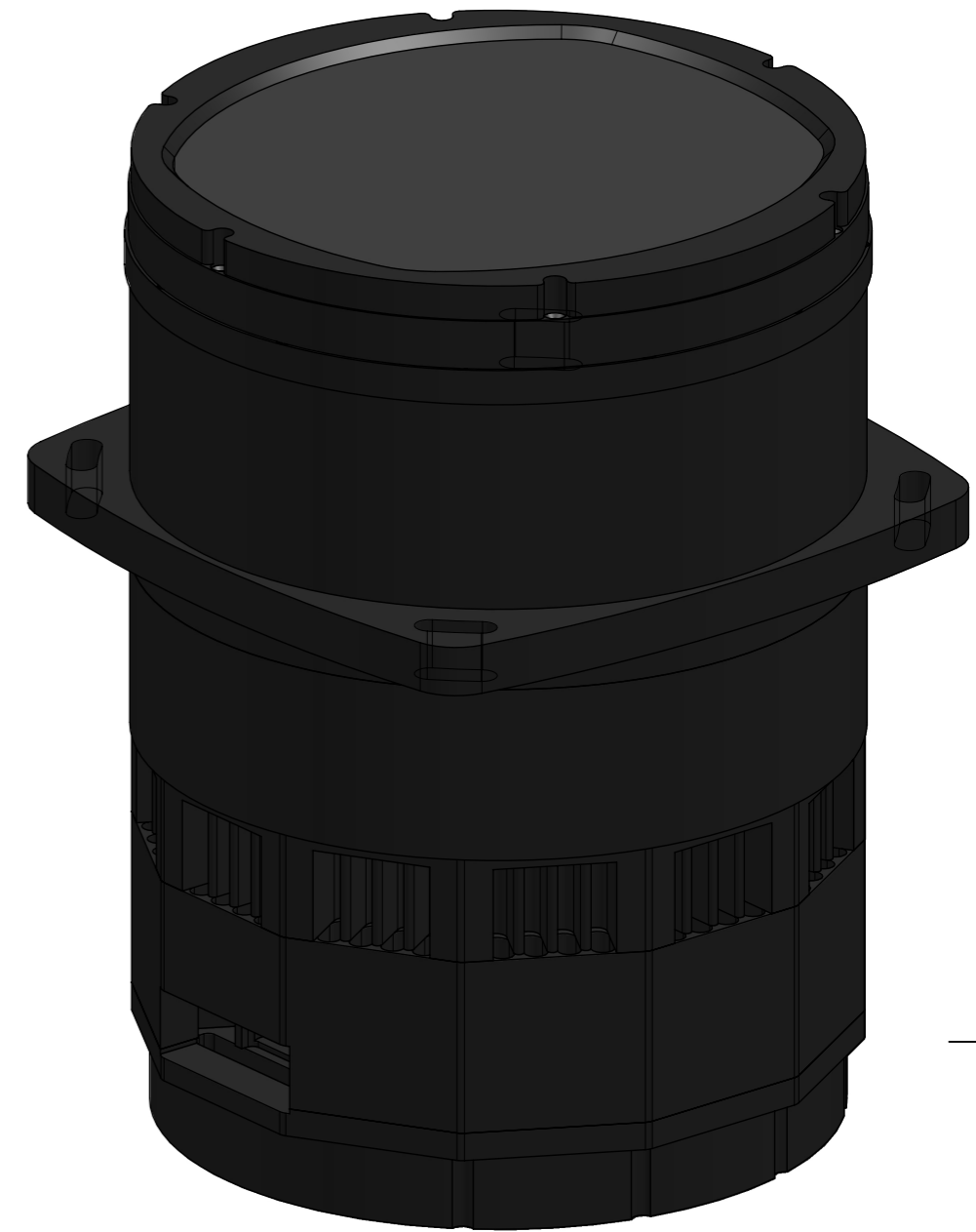
VIEW C SCALE 1:1

This drawings is the property of XIMEA GmbH. No use thereof shall be made other than as a reference for proposals as submitted to XIMEA GmbH for jobs to be executed in conformity with such proposals unless the consent of said XIMEA GmbH has previously been obtained. No part of this drawing shall be copied or duplicated or its contents disclosed. The information contained on this drawing is confidential and proprietary.